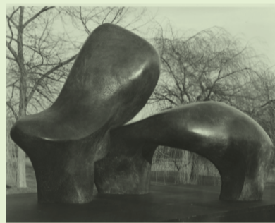
⑭ Working Model for Sheep Piece 1971