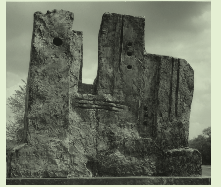
⑥ The Wall: Background for Sculpture 1962