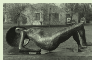
⑳ Falling Warrior 1956-57