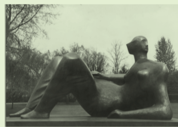
⑮ Reclining Figure: Angles 1979