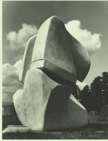
③ Locking Piece 1962-63