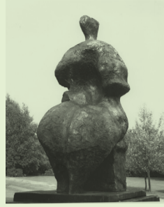
② Seated Woman 1958-59