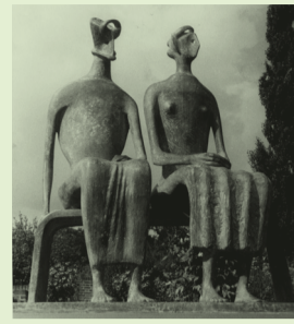
④ King and Queen 1952-53