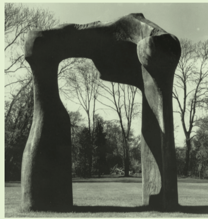
⑨ The Arch 1969