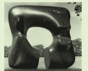
⑰ Square Form with Cut 1969