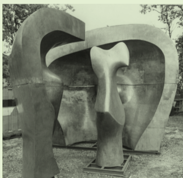
⑱ Large Figure in a Shelter 1985-86