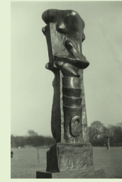
⑤ Upright Motive No.8 1955-56