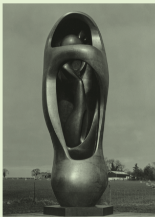
⑫ Large Upright Internal/External Form 1953-54