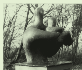
㉑ Mother and Child 1949

Don't Miss: Henry Moore: Monumental Nature at Kew Gardens 9 May 2026 - 31 January 2027 Henry Moore and more at Wakehurst 5 June 2026 - May 2027