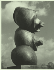
⑦ Three Part Object 1960