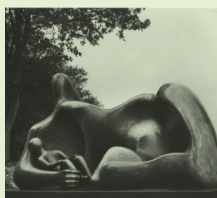
⑲ Draped Reclining Mother and Baby 1983