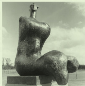
⑬ Woman 1957-58