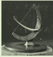
① Working Model for Sundial 1965