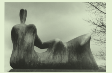
⑪ Reclining Figure: Hand 1979