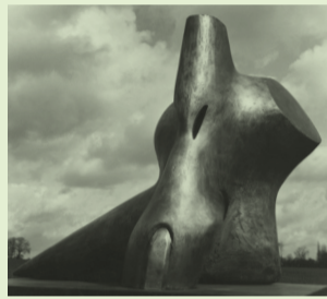
⑧ Torso with Point 1967