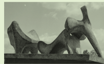
⑯ Three Piece Reclining Figure No.2: Bridge Prop 1963