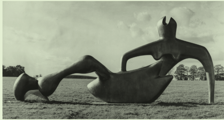
⑩ Large Reclining Figure 1984